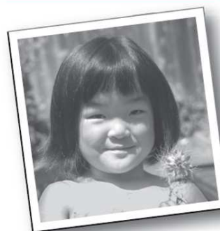
MOLLY RECEIVED BLOOD PRODUCTS DURING HER OPEN HEART SURGERIES

Please continue to share your good health by donating blood regularly.